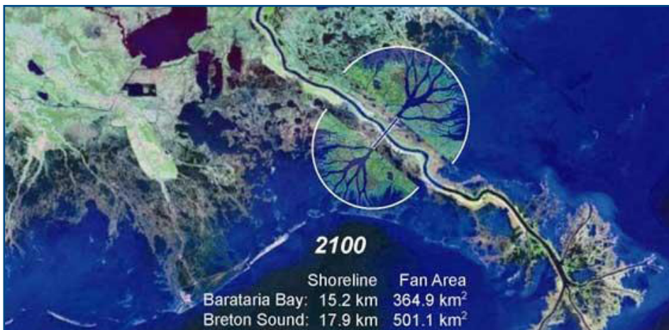
Computer-generated image of the possible results of a 50-year Mississippi River delta restoration scenario.